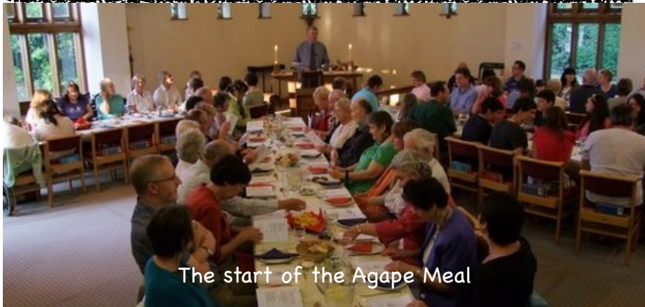
The start of the Agape Meal