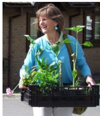
A happy plant buyer